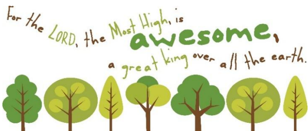
PSALM 47:2, NRSV